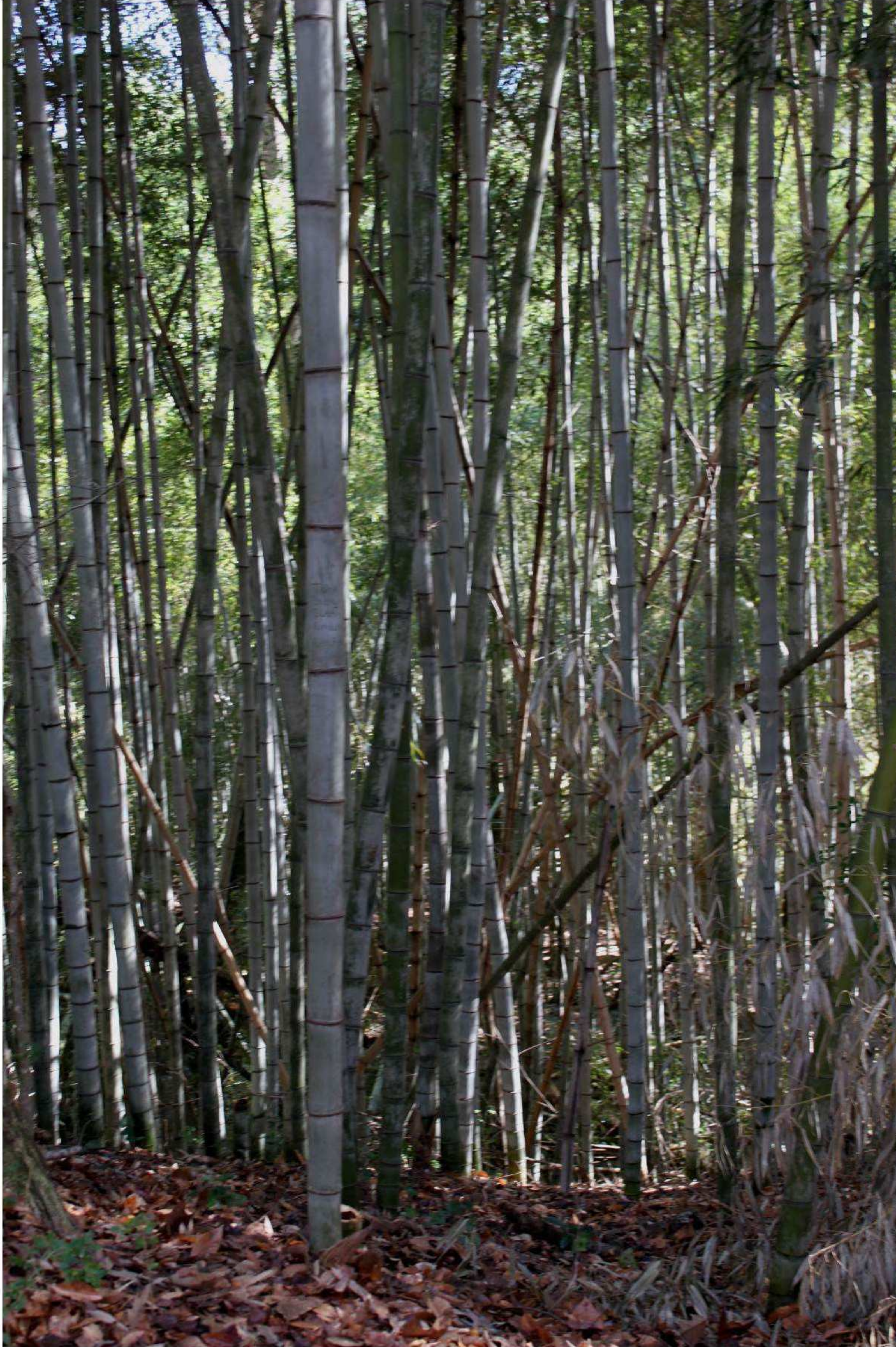
Figure 9 Phyllostachys nigra var. henonis (Poaceae).